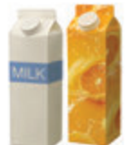
CARTONS & TETRAPAK