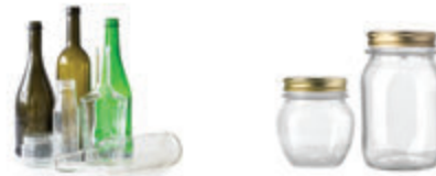
GLASS FOOD & DRINKS BOTTLES AND JARS