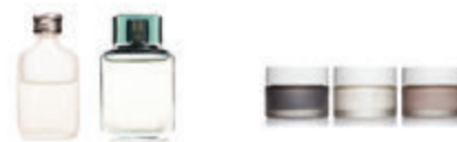
GLASS BOTTLES AND JARS FROM COSMETICS

Packaging must be empty and clean /free from food and liquid/