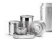
TINS & CANS